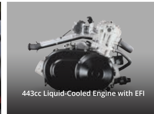
443cc Liquid-Cooled Engine with EFI