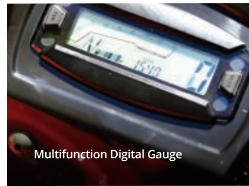
Multifunction Digital Gauge